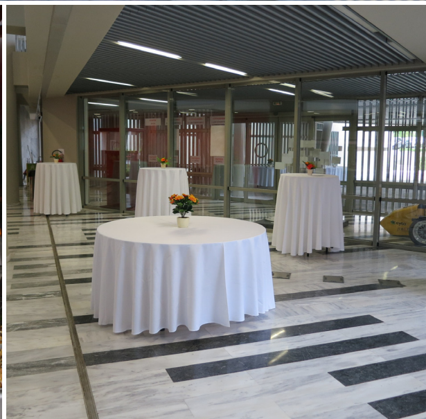
Specially designated areas for the organization of dinners, receptions and coffee breaks